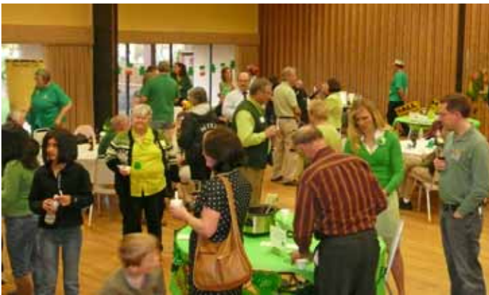
The crowd enjoys some Irish stews and Irish music at the Pioneer Community Center on Wednesday, March 17.